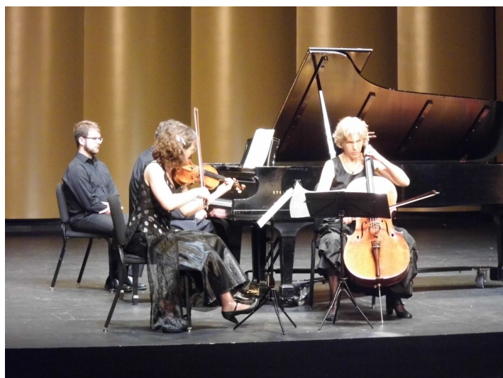
Peabody Trio performs

Thank you to the members of NAMTA for all of your efforts in planning a fabulous conference!