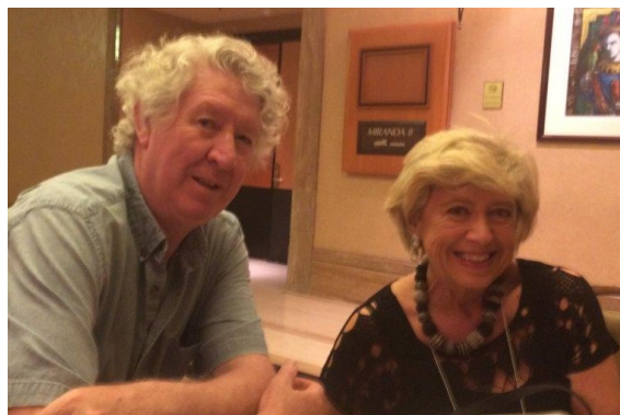
Members from across the State attended the 2015 MTNA National Conference